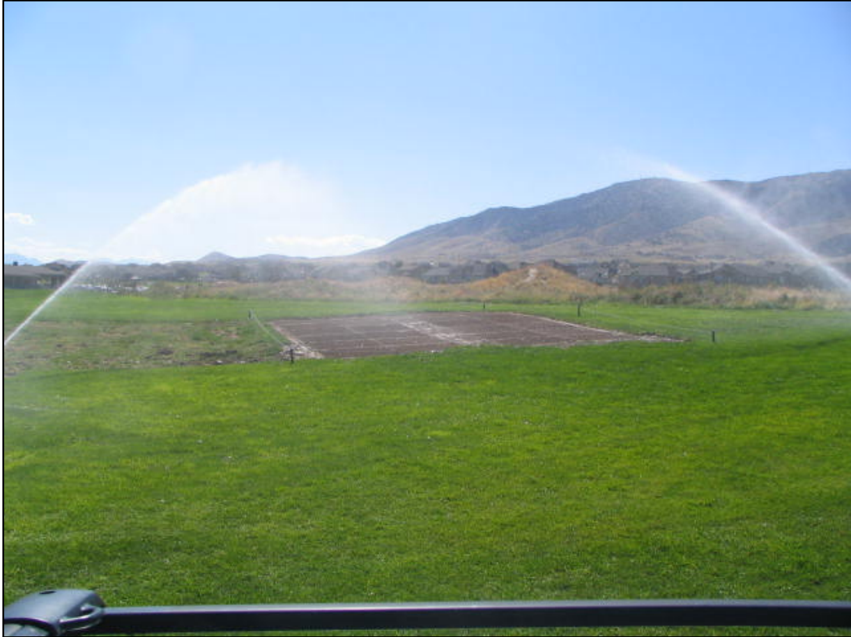
Figure 2. The seed, fertilizer and humic acid were watered in at planting and irrigation was done to keep the soil moist to encourage germination.