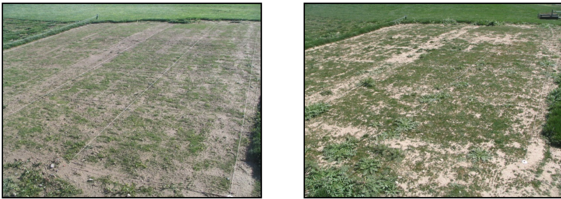
Figure 7a (left), 7b (right). Once the seed was germinated, visual observation of the plots showed no differences in the rate of establishment throughout the experiment as indicated by pictures taken on 11 November, 2008 (left) and 18 April, 2009 (right).

Soil tested at the beginning of the study revealed salt levels ( EC_e = 3.99 dS/m) higher than what is recommended for growing bluegrass turf ( EC_e < 3.0 dS/m). This may or may not have negatively affected the growth of the Kentucky bluegrass in this study. However the grass was not visually affected by these saline conditions during establishment – and it was interesting to note that the humic acid treatments provided no growth benefit to the turf in these conditions compared to the control. Further investigation into the influence of humic acid on turf establishment in saline soils is warranted.