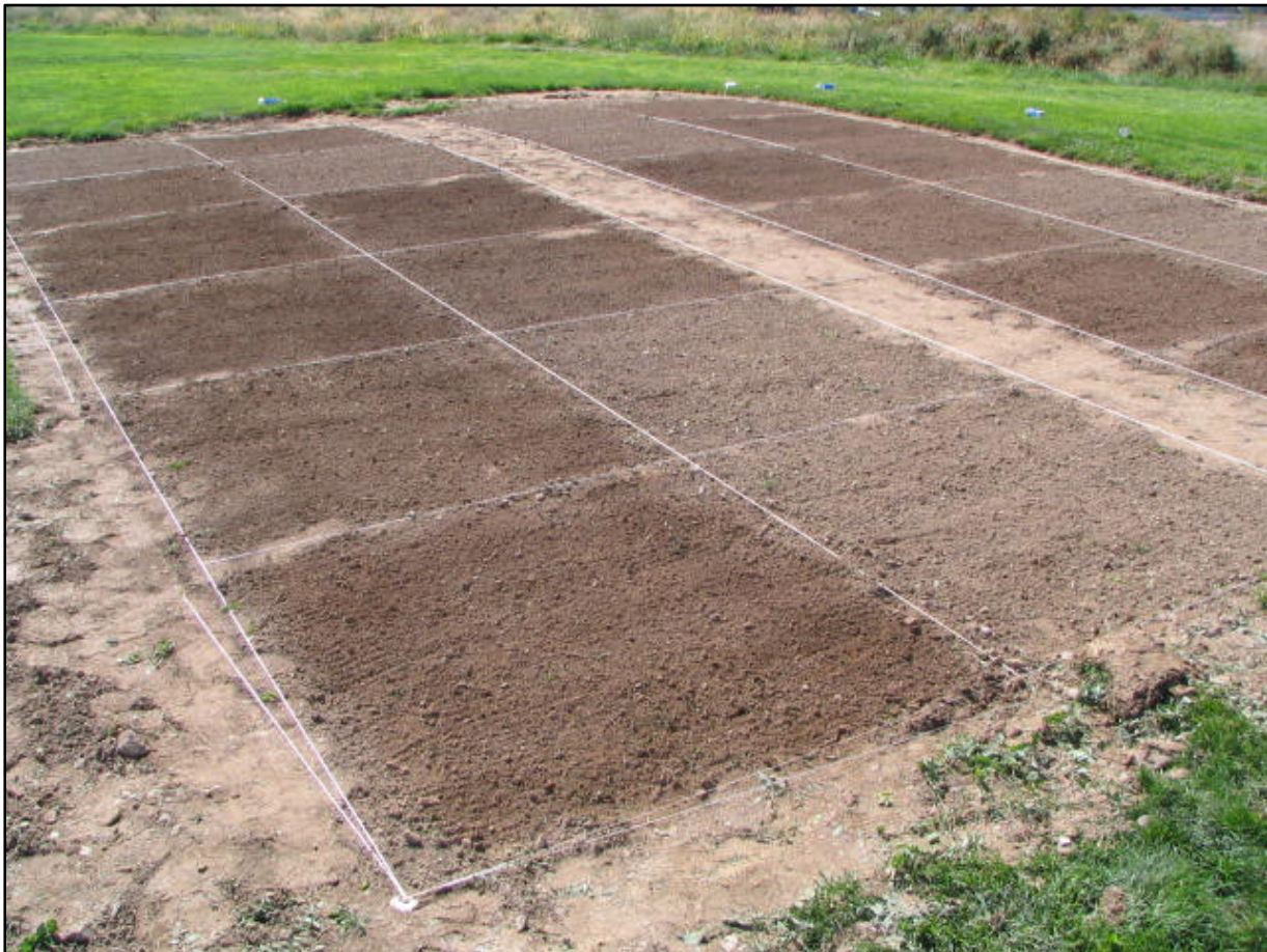
Figure 1. Experiment layout after planting seed and applying humic acid to the soil. The humic acid treatments are dark in color compared to the controls which received no liquid humic acid.