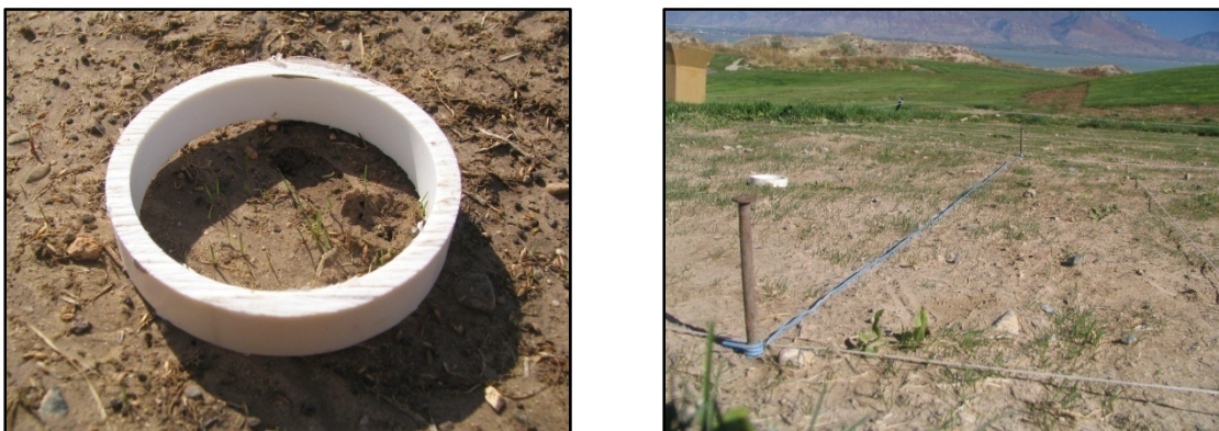
Figure 5a (left), 5b (right). A piece of PVC pipe (left) and a line-intersect (right) were used to count individual plants in each plot to determine germination effects from the humic acid.

counts were also done on 23 October, 2008 but not done after this date as counting the seedlings became difficult once they began to mature. Once germinated, establishment was visually evaluated on a density scale of 1-9, with 9 having the most dense turf cover and 1 having the least cover. Digital images of the plots were taken the same days as density ratings and analyzed for percent green cover using SigmaScan Pro software (v 5.0, SPSS, Chicago, IL). This has been an effective method of determining the percentage of turf cover in the field (Richardson et al., 2001). The software measures green pixels in each image and divides them by the total pixels for a percent green cover scale of 0-100, with 100 having complete green cover and 0 having no green cover – or bare soil. Small weeds present in the plots were removed by hand on each evaluation date before images were taken to improve the accuracy.