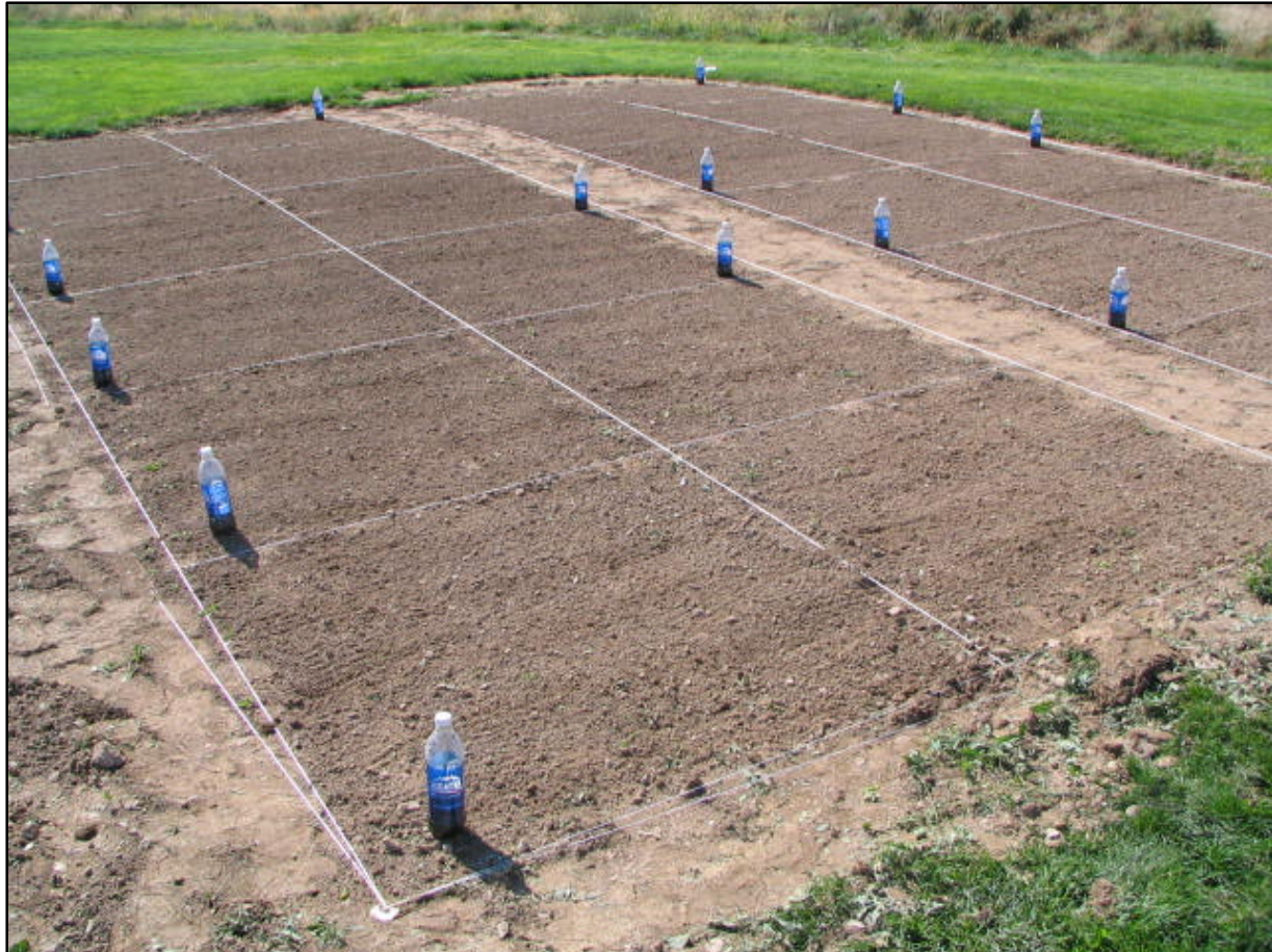
Figure 4. Experiment design with humic acid treatments in bottles in individual blocks after Kentucky bluegrass seed was planted at 2 lbs/1000ft 2 .